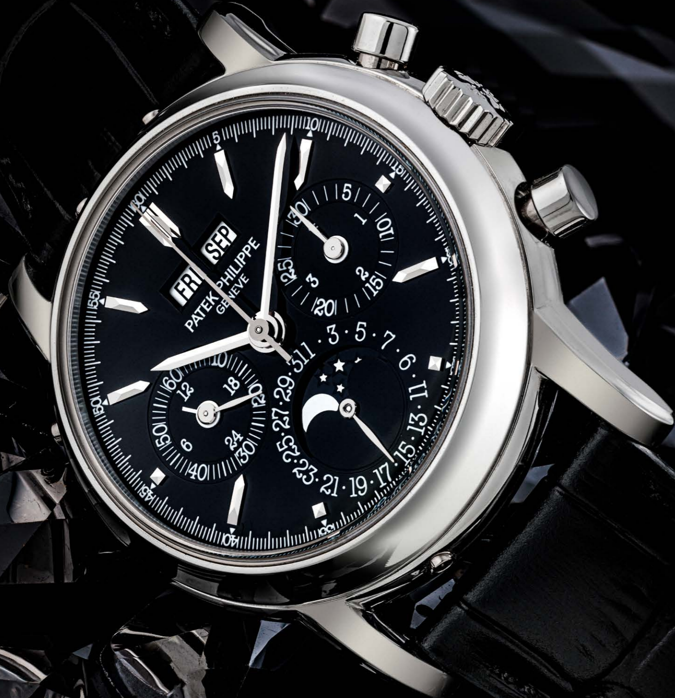
△ 2421 PATEK PHILIPPE. A RARE PLATINUM PERPETUAL CALENDAR CHRONOGRAPH WRISTWATCH WITH MOON PHASES, 24 HOUR, LEAP YEAR INDICATION AND BLACK DIAL REF. 3970EP, MANUFACTURED IN 2002

Movement: Manual Dial: Black Case: 36 mm. With: Platinum Patek Philippe deployant clasp, Patek Philippe Extract from the Archives, Patek Philippe service invoice, setting pin, presentation box and outer packaging Note: Serial numbers are available upon request