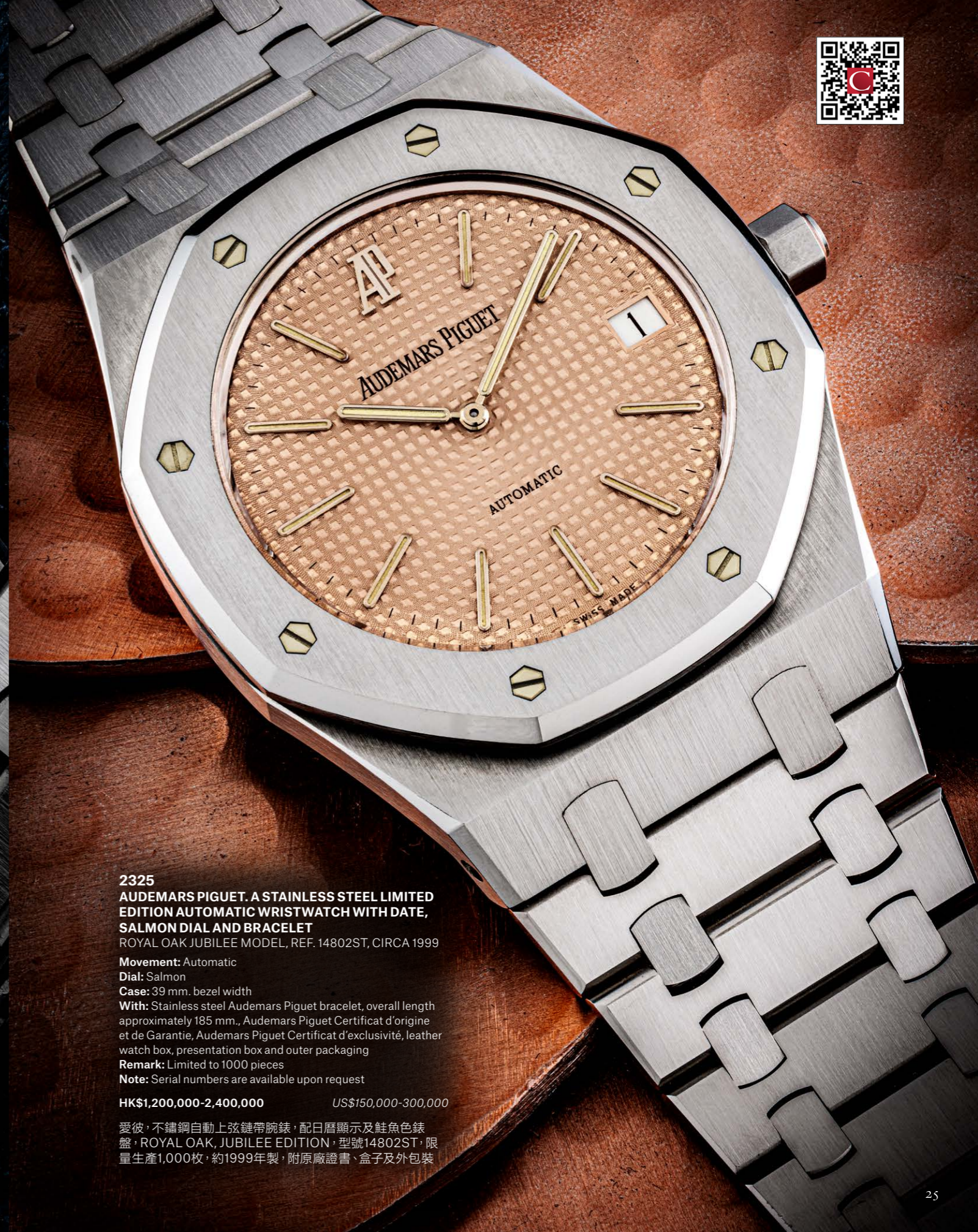
2325 AUDEMARS PIGUET. A STAINLESS STEEL LIMITED EDITION AUTOMATIC WRISTWATCH WITH DATE, SALMON DIAL AND BRACELET ROYAL OAK JUBILEE MODEL, REF. 14802ST, CIRCA 1999

Movement: Automatic Dial: Salmon Case: 39 mm. bezel width With: Stainless steel Audemars Piguet bracelet, overall length approximately 185 mm., Audemars Piguet Certificat d'origine et de Garantie, Audemars Piguet Certificat d'exclusivité, leather watch box, presentation box and outer packaging Remark: Limited to 1000 pieces Note: Serial numbers are available upon request