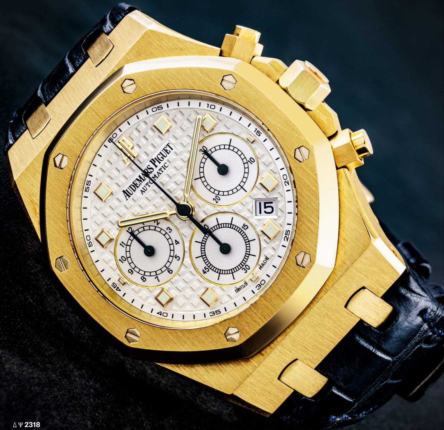
△ Ψ 2318 AUDEMARS PIGUET. AN 18K GOLD AUTOMATIC CHRONOGRAPH WRISTWATCH WITH DATE ROYAL OAK MODEL, REF. 26022BA

Movement: Automatic Dial: Silvered Case: 41 mm. bezel width With: 18k gold Audemars Piguet deployant clasp, Audemars Piguet Warranty, product literature, presentation box and outer packaging Note: Serial numbers are available upon request