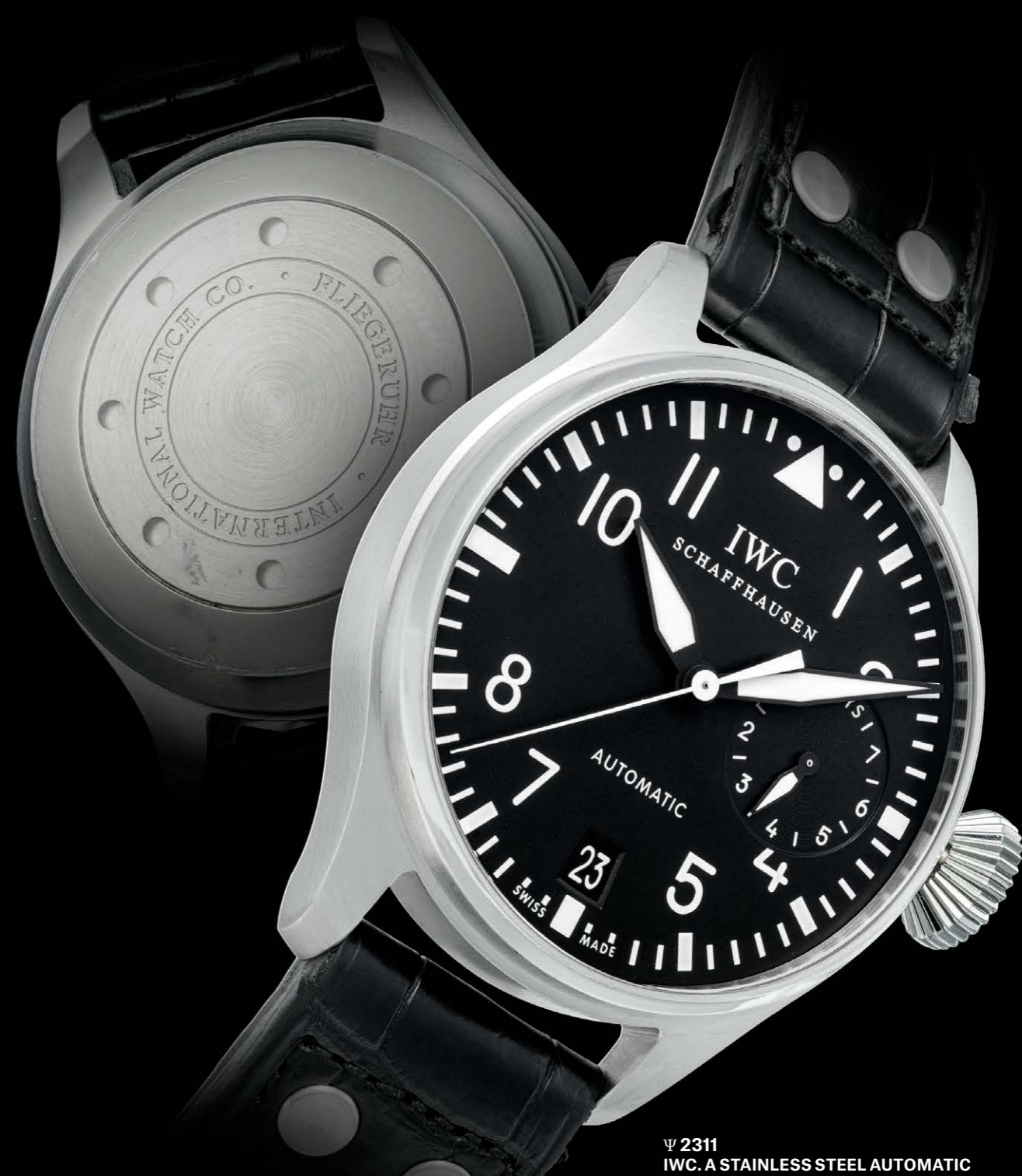
Ψ 2311 IWC. A STAINLESS STEEL AUTOMATIC WRISTWATCH WITH SWEEP CENTRE SECONDS, DATE AND 8 DAYS POWER RESERVE BIG PILOT MODEL, REF. IW500401, CIRCA 2007

Movement: Automatic Dial: Black Case: 46 mm. With: Stainless steel IWC deployant clasp, IWC Guarantee, product literature, presentation box and outer packaging Note: Serial numbers are available upon request