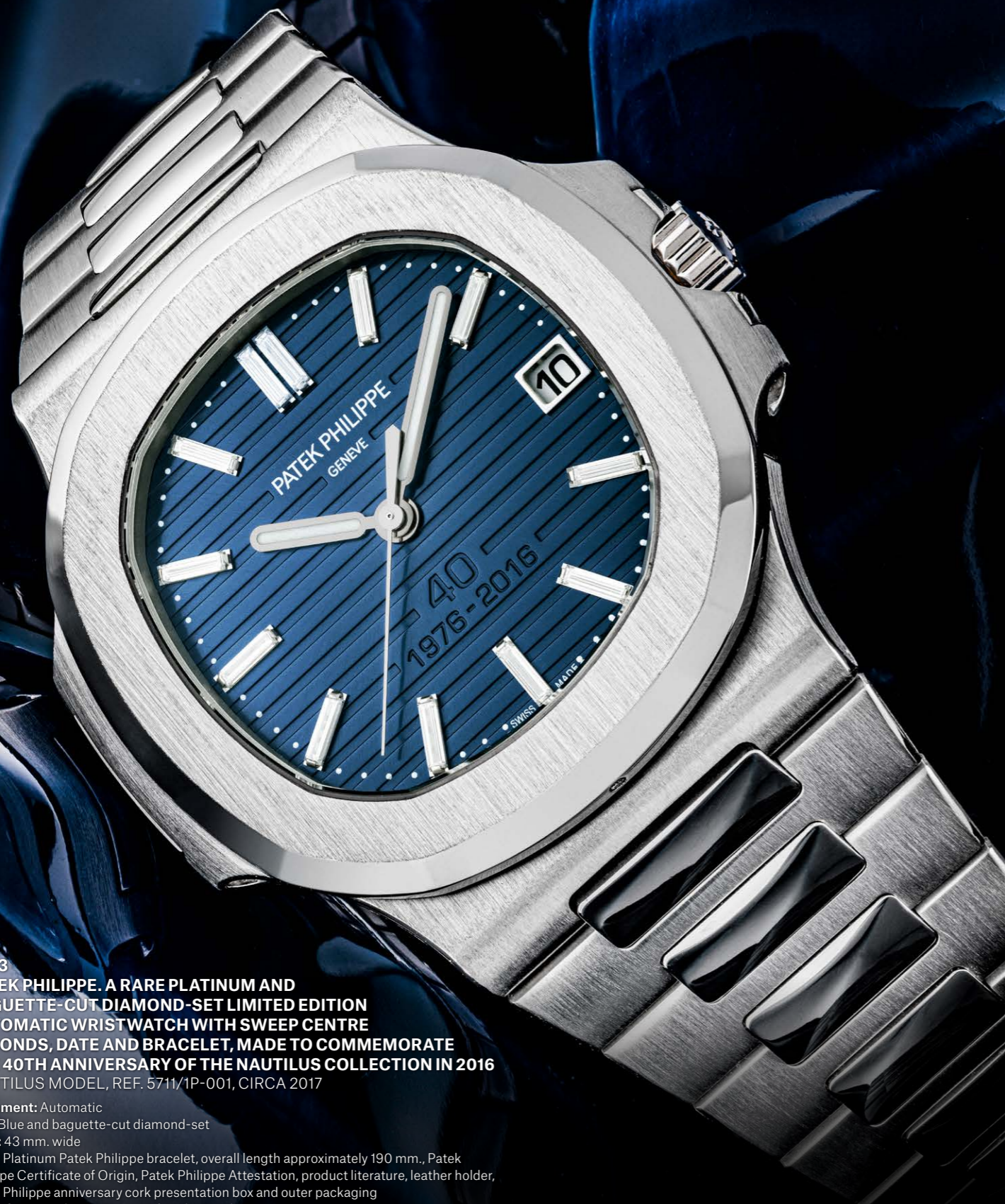
2433 PATEK PHILIPPE. A RARE PLATINUM AND BAGUETTE-CUT DIAMOND-SET LIMITED EDITION AUTOMATIC WRISTWATCH WITH SWEEP CENTRE SECONDS, DATE AND BRACELET, MADE TO COMMEMORATE THE 40TH ANNIVERSARY OF THE NAUTILUS COLLECTION IN 2016 NAUTILUS MODEL, REF. 5711/1P-001, CIRCA 2017

Movement: Automatic Dial: Blue and baguette-cut diamond-set Case: 43 mm. wide With: Platinum Patek Philippe bracelet, overall length approximately 190 mm., Patek Philippe Certificate of Origin, Patek Philippe Attestation, product literature, leather holder, Patek Philippe anniversary cork presentation box and outer packaging Remark: Limited to 700 pieces, fourth piece known Note: Serial numbers are available upon request