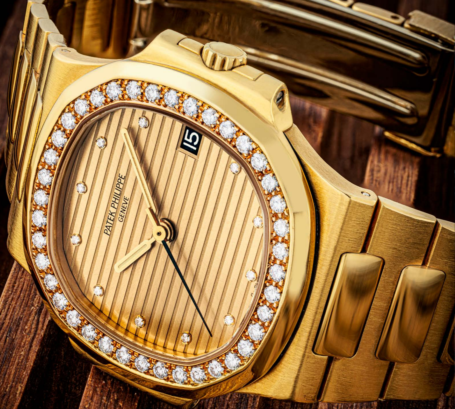
2435 PATEK PHILIPPE. AN 18K GOLD AND DIAMOND-SET AUTOMATIC WRISTWATCH WITH SWEEP CENTRE SECONDS, DATE AND BRACELET NAUTILUS MODEL, REF. 3800/3, MANUFACTURED IN 1988

Movement: Automatic Dial: Golden and diamond-set Case: 37 mm. wide With: 18k gold Patek Philippe bracelet overall length approximately 175 mm., Patek Philippe Extract from the Archives, presentation box and outer packaging Remark: Fresh to the market Note: Serial numbers are available upon request