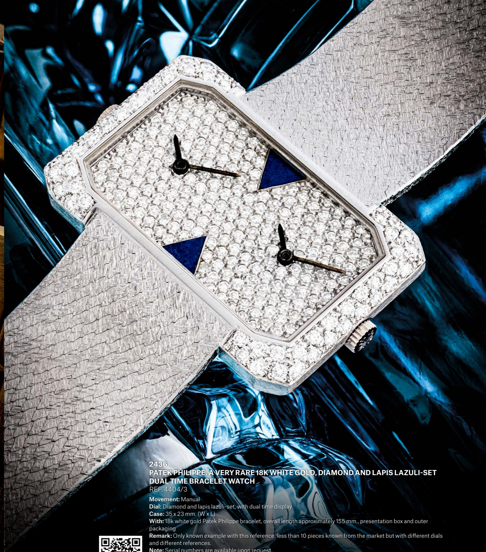
2436 PATEK PHILIPPE. A VERY RARE 18K WHITE GOLD, DIAMOND AND LAPIS LAZULI-SET DUAL TIME BRACELET WATCH REF. 4404/3

Movement: Manual Dial: Diamond and lapis lazuli-set, with dual time display Case: 35 x 23 mm. (W x L) With: 18k white gold Patek Philippe bracelet, overall length approximately 155 mm., presentation box and outer packaging Remark: Only known example with this reference, less than 10 pieces known from the market but with different dials and different references. Note: Serial numbers are available upon request