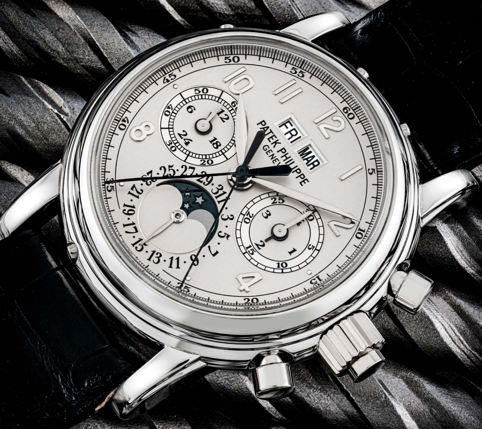
Ψ 2423 PATEK PHILIPPE. A PLATINUM PERPETUAL CALENDAR SPLIT SECONDS CHRONOGRAPH WRISTWATCH WITH MOON PHASES, 24 HOUR AND LEAP YEAR INDICATION REF. 5004P, CIRCA 2003

Movement: Manual Dial: Silvered Case: 36.5 mm. With: Platinum Patek Philippe deployant clasp, Patek Philippe Certificate of Origin and product literature in leather folder, presentation box and outer packaging Remark: Approximately 300 pieces made Note: Serial numbers are available upon request