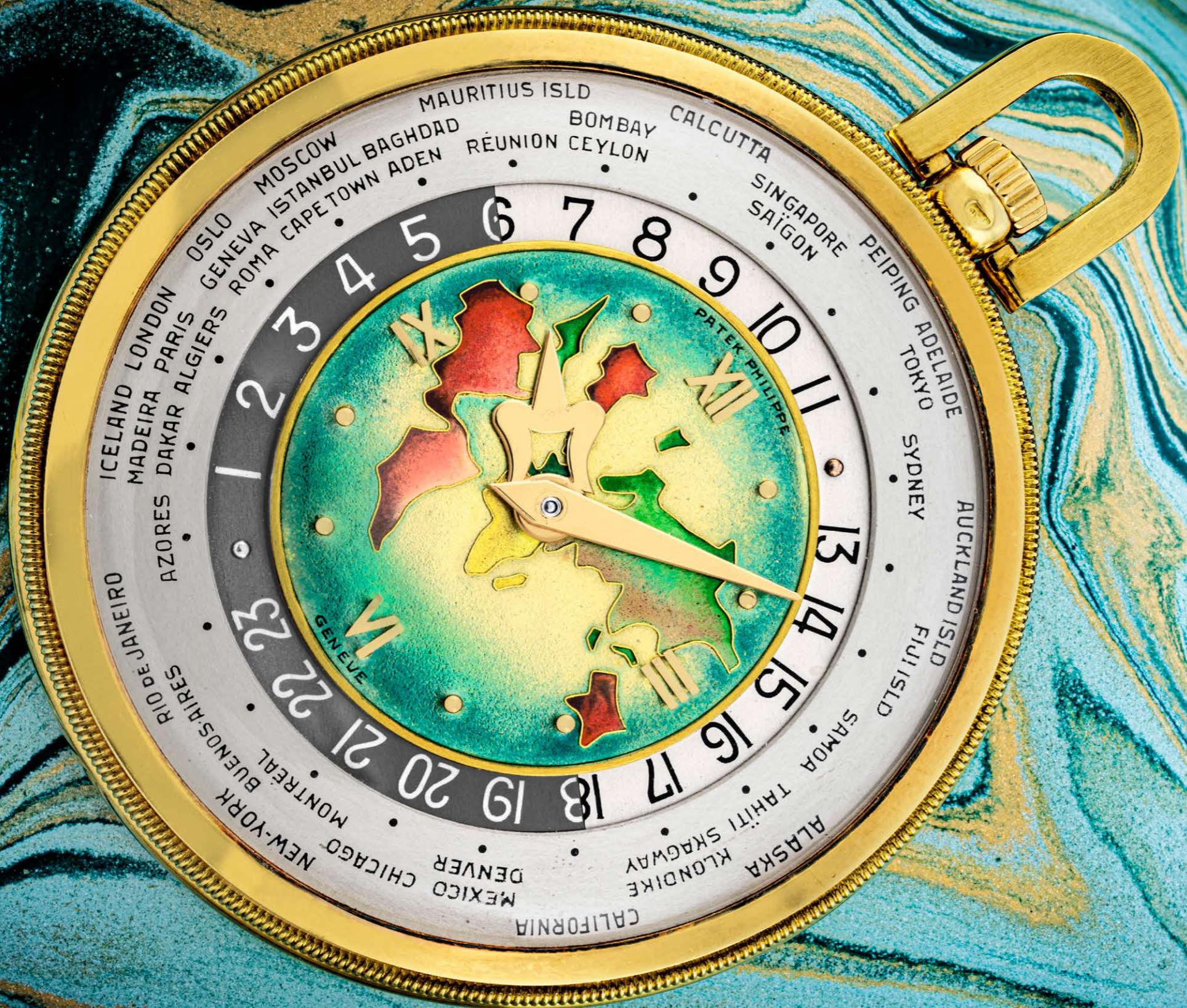
2443 PATEK PHILIPPE. A MAGNIFICENT AND EXTREMELY RARE 18K GOLD WORLD TIME POCKET WATCH WITH WORLD MAP CLOISSONNÉ ENAMEL DIAL REF. 605HU, MANUFACTURED IN 1948

Movement: Manual Dial: Cloisonné enamel world map Case: 44 mm. With: Patek Philippe Extract from the Archives, Patek Philippe service invoice 2022 Remark: Fresh to the market, exceptional condition, one out of three known Note: Serial numbers are available upon request