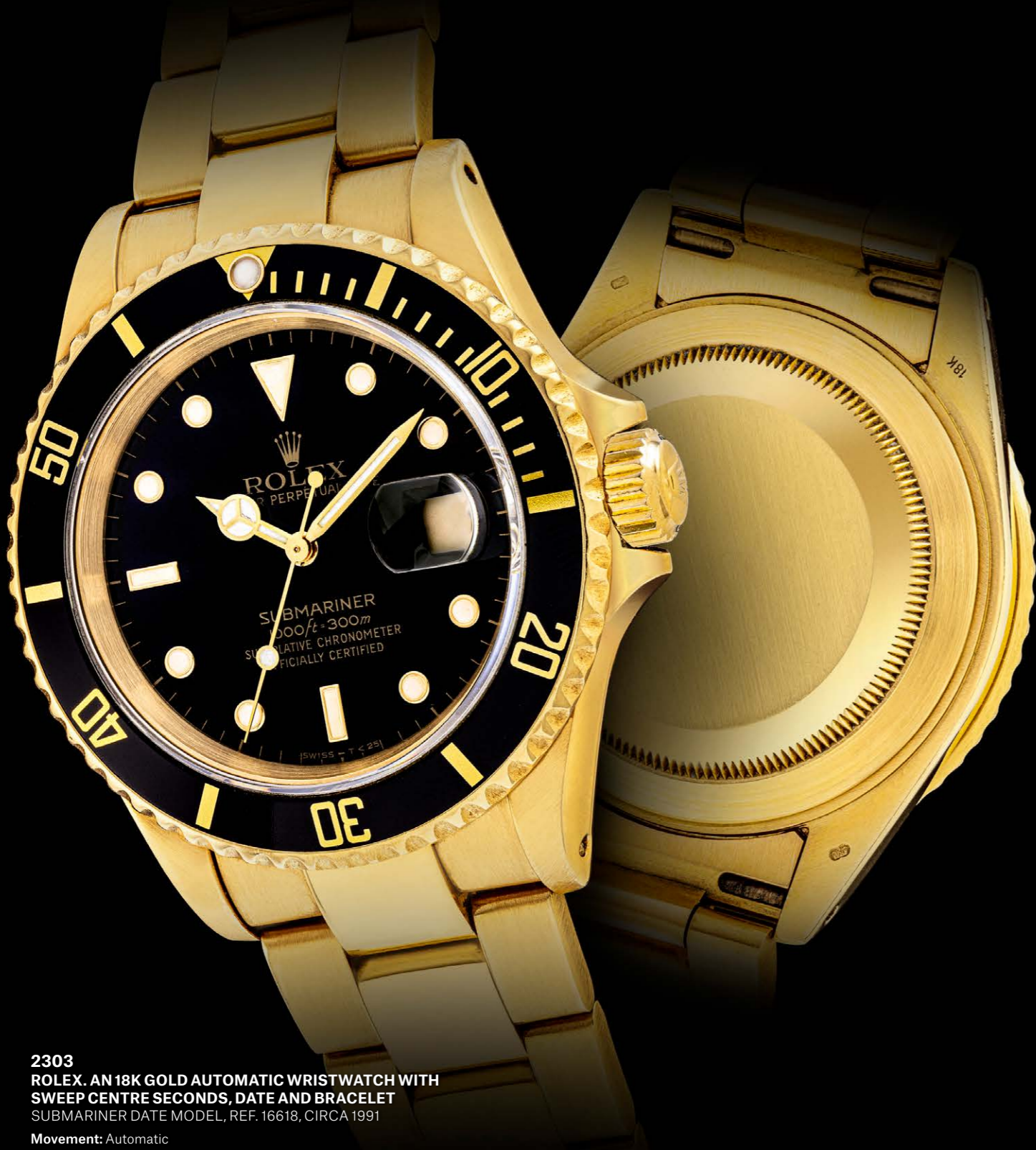
2303 ROLEX. AN 18K GOLD AUTOMATIC WRISTWATCH WITH SWEEP CENTRE SECONDS, DATE AND BRACELET SUBMARINER DATE MODEL, REF. 16618, CIRCA 1991

Movement: Automatic Dial: Black Case: 40 mm. With: 18k gold Rolex Oyster bracelet, overall length approximately 175 mm. Note: Serial numbers are available upon request