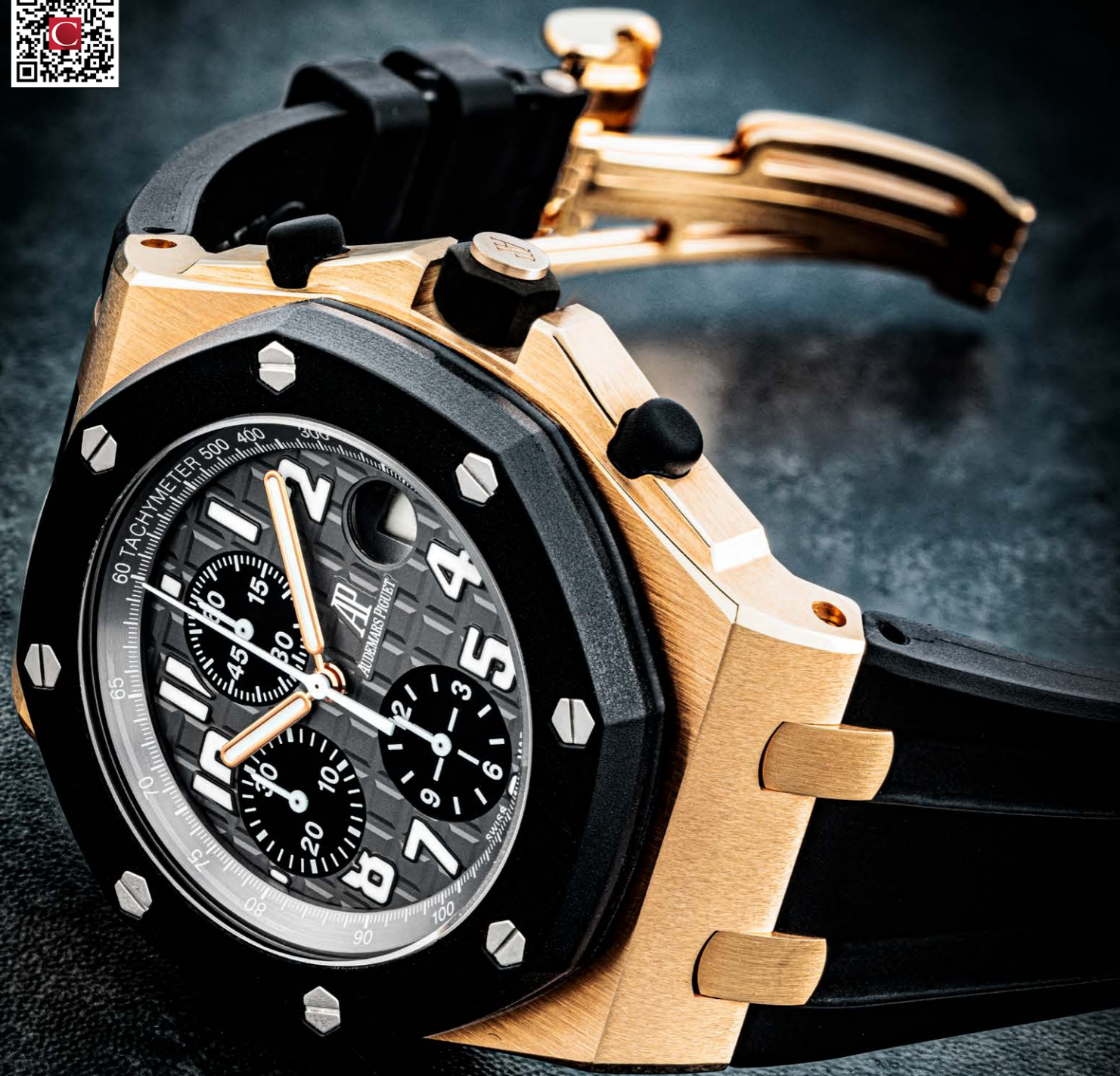
2320 AUDEMARS PIGUET. AN 18K PINK GOLD AUTOMATIC CHRONOGRAPH WRISTWATCH WITH DATE ROYAL OAK OFFSHORE MODEL, REF. 259400K

Movement: Automatic Dial: Dark grey Case: 42 mm. bezel width With: 18k pink gold Audemars Piguet deployant clasp, Audemars Piguet Warranty, product literature, presentation box and outer packaging Note: Serial numbers are available upon request