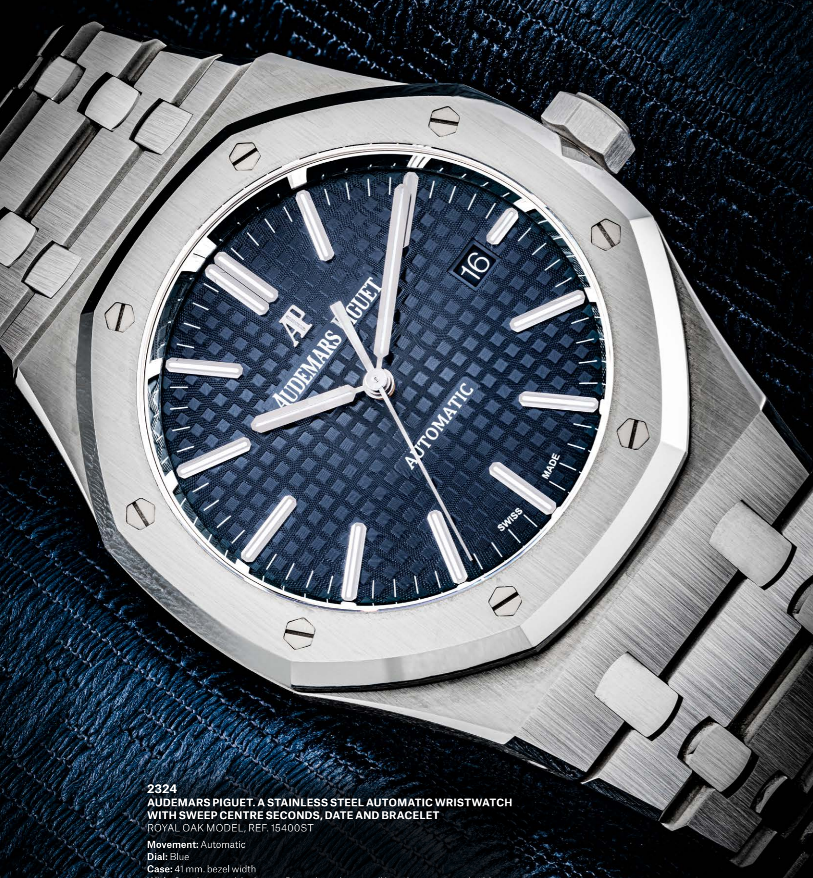
2324 AUDEMARS PIGUET. A STAINLESS STEEL AUTOMATIC WRISTWATCH WITH SWEEP CENTRE SECONDS, DATE AND BRACELET ROYAL OAK MODEL, REF. 15400ST

Movement: Automatic Dial: Blue Case: 41 mm. bezel width With: Stainless steel Audemars Piguet bracelet, overall length approximately 180 mm., Audemars Piguet International Warranty Card, product literature, presentation box and outer packaging Note: Serial numbers are available upon request