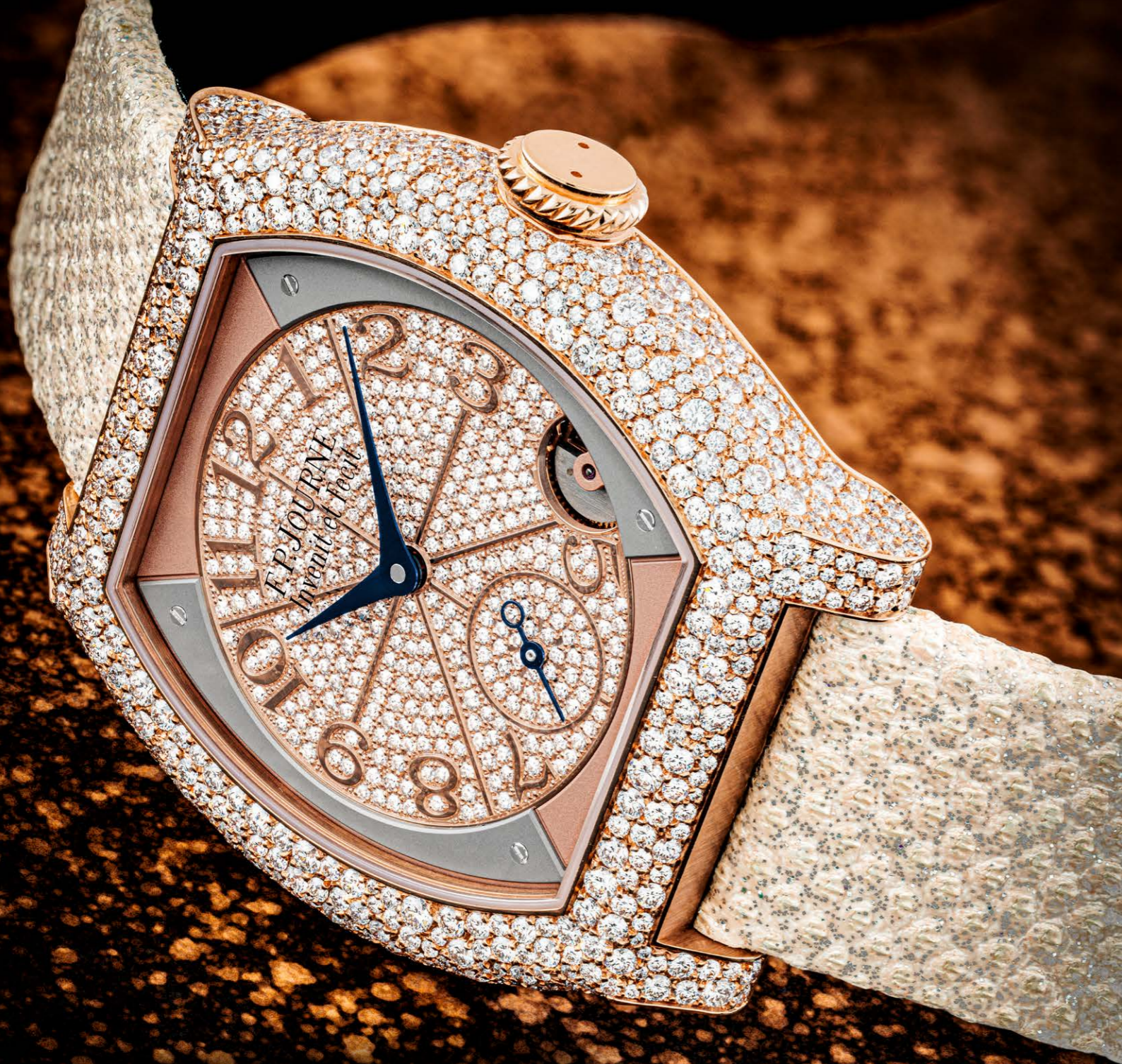
Ψ ⊕ 2378 F.P. JOURNE. AN ATTRACTIVE LADY'S 18K PINK GOLD AND DIAMOND-SET WRISTWATCH ÉLÉGANTE 40 MODEL, CIRCA 2021

Movement: Quartz Dial: Diamond-set Case: 35 x 40 mm. (W x L) With: 18k pink gold and diamond-set F.P. Journe deployant clasp, F.P. Journe International Guarantee Card, presentation box and outer packaging Remark: First time seen at auction, new condition Note: Serial numbers are available upon request