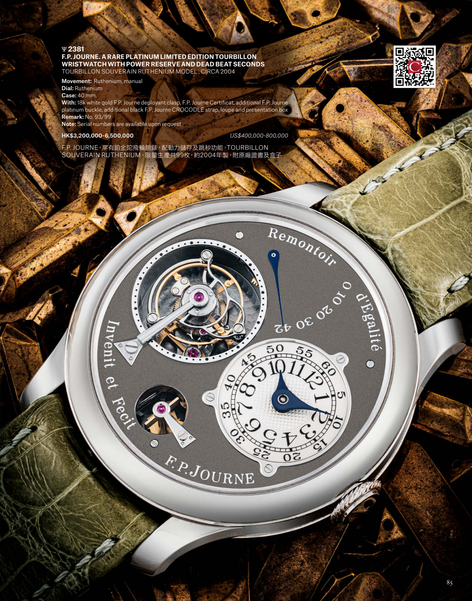
Ψ 2381 F.P. JOURNE. A RARE PLATINUM LIMITED EDITION TOURBILLON WRISTWATCH WITH POWER RESERVE AND DEAD BEAT SECONDS TOURBILLON SOUVERAIN RUTHENIUM MODEL, CIRCA 2004

Movement: Ruthenium, manual Dial: Ruthenium Case: 40 mm. With: 18k white gold F.P. Journe deployant clasp, F.P. Journe Certificat, additional F.P. Journe platinum buckle, additional black F.P. Journe CROCODLE strap, loupe and presentation box Remark: No. 93/99 Note: Serial numbers are available upon request