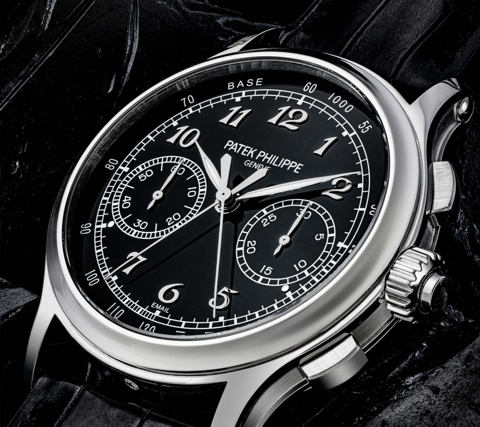
Ψ 2424 PATEK PHILIPPE. A PLATINUM SPLIT SECONDS CHRONOGRAPH WRISTWATCH WITH BLACK ENAMEL DIAL AND BREGUET NUMERALS REF. 5370P-001, CIRCA 2019

Movement: Manual Dial: Black enamel with Breguet numerals Case: 41 mm. With: Platinum Patek Philippe deployant clasp, Patek Philippe Certificate of Origin, additional solid case back, sales tag, leather portfolio, product literature, presentation box and outer packaging Remark: Fresh to the market Note: Serial numbers are available upon request