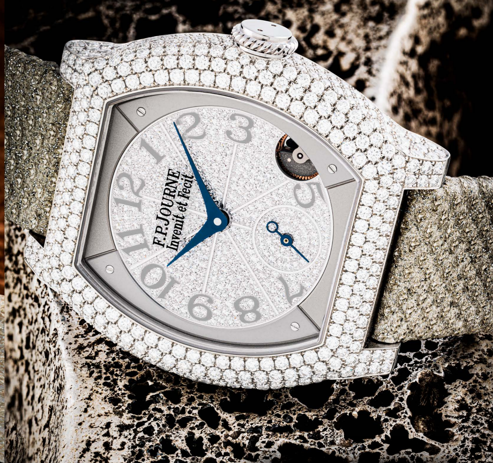
Ψ ⊕ 2379 F.P. JOURNE. AN ATTRACTIVE LADY'S PLATINUM AND DIAMOND-SET WRISTWATCH ÉLÉGANTE 40 MODEL, CIRCA 2021

Movement: Quartz Dial: Diamond-set Case: 35 x 40 mm. (W x L) With: 18k white gold and diamond-set F.P. Journe deployant clasp, F.P. Journe International Guarantee Card, presentation box and outer packaging Remark: First time seen at auction, new condition Note: Serial numbers are available upon request