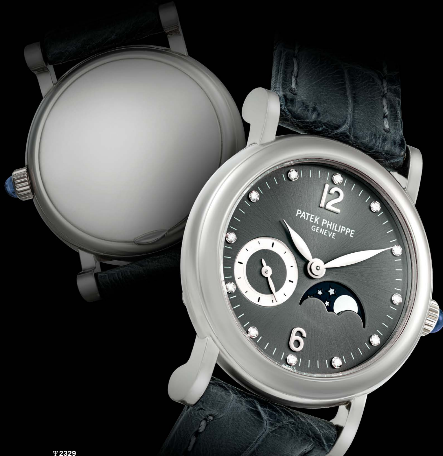
Ψ 2329 PATEK PHILIPPE. A LADY'S 18K WHITE GOLD AND DIAMOND-SET WRISTWATCH WITH MOON PHASES REF. 4857G, CIRCA 1999

Movement: Manual Dial: Slate grey and diamond-set Case: 29 mm. With: 18k white gold Patek Philippe deployant clasp, Patek Philippe Certificate of Origin, product literature and leather holder Remark: Fresh to the market, fifth example known Note: Serial numbers are available upon request