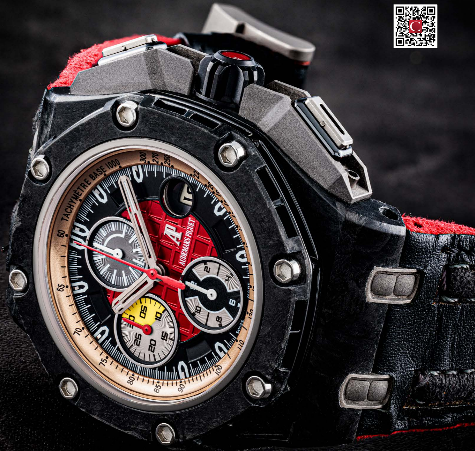
2321 AUDEMARS PIGUET. A CARBON, TITANIUM AND CERAMIC LIMITED EDITION AUTOMATIC CHRONOGRAPH WRISTWATCH WITH DATE ROYAL OAK OFFSHORE GRAND PRIX MODEL, REF. 26290IO, CIRCA 2010

Movement: Automatic Dial: Black and red Case: 44 mm. bezel width With: Titanium Audemars Piguet buckle, Audemars Piguet Warranty, presentation box and outer packaging Remark: Limited to 1750 pieces Note: Serial numbers are available upon request