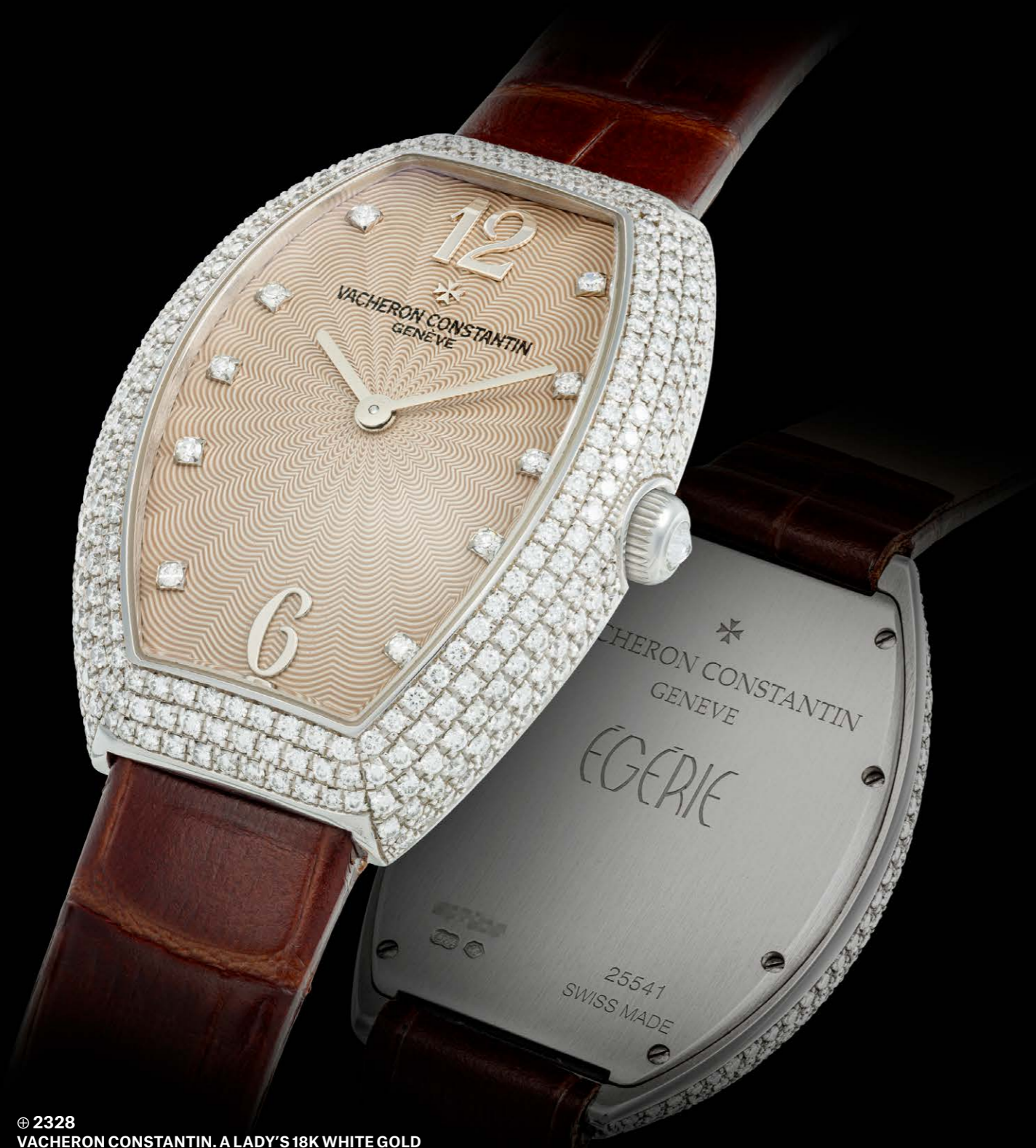
⊕ 2328 VACHERON CONSTANTIN. A LADY'S 18K WHITE GOLD AND DIAMOND-SET TONNEAU SHAPE WRISTWATCH REF. 25541/000G, CIRCA 2005

Movement: Quartz Dial: Light beige and diamond-set Case: 27 x 37 mm. (W x L) With: 18k white gold and diamond-set Vacheron Constantin buckle, Vacheron Constantin Certificate, presentation box and outer packaging. Note: Serial numbers are available upon request