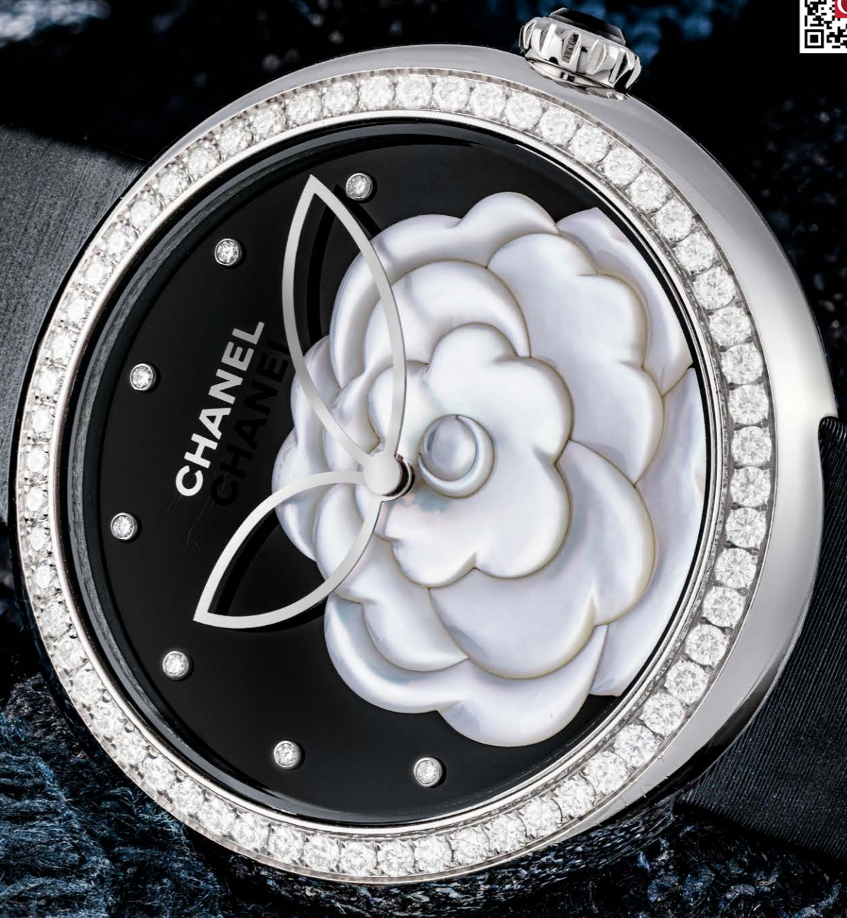
~ ⊕ 2339 CHANEL. A LADY'S ATTRACTIVE 18K WHITE GOLD AND DIAMOND-SET WRISTWATCH WITH ONYX AND MOTHER-OF-PEARL DIAL MADEMOISELLE PRIVÉ MODEL Movement: Quartz Dial: Onyx, mother-of-pearl marquetry camellia and diamond-set Case: 37.5 mm. With: 18k white gold and diamond-set Chanel buckle Note: Serial numbers are available upon request HK$100,000-180,000 US$12,000-22,000

香奈兒·吸引·18K白金鑲鑽石女裝腕錶·配瑪瑙及母貝錶盤·MADEMOISELLE PRIVÉ