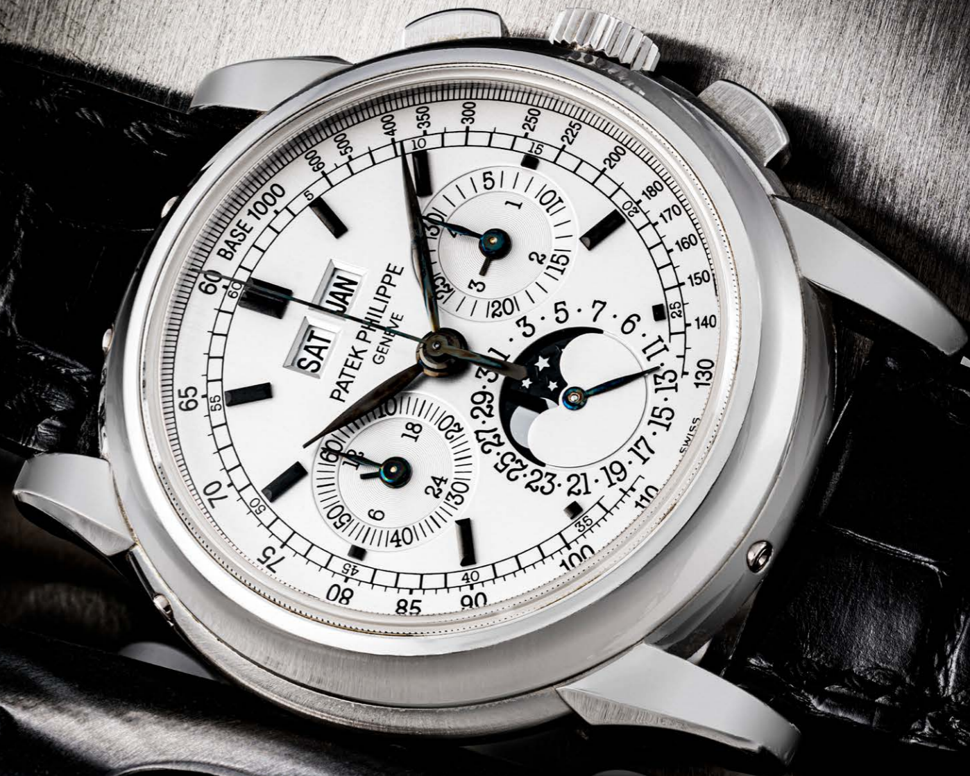
Ψ 2422 PATEK PHILIPPE. AN 18K WHITE GOLD PERPETUAL CALENDAR CHRONOGRAPH WRISTWATCH WITH MOON PHASES, 24 HOUR AND LEAP YEAR INDICATION REF. 5970G

Movement: Manual Dial: Silvered Case: 40 mm. With: 18k white gold Patek Philippe deployant clasp Remark: Lemania base calibre, fresh to the market Note: Serial numbers are available upon request