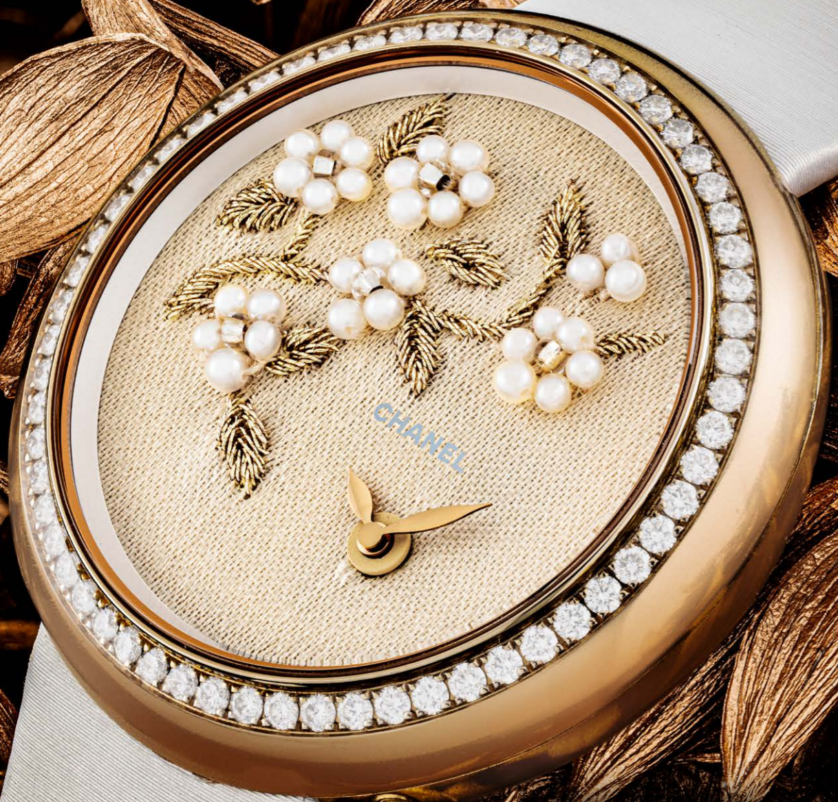
⊕ 2338 CHANEL. A LADY'S ATTRACTIVE 18K PINK GOLD, PEARL AND DIAMOND-SET WRISTWATCH MADEMOISELLE PRIVÉ MODEL Movement: Quartz Dial: Silk dial set with metallic leaves and pearls Case: 37.5 mm. With: 18k pink gold and diamond-set Chanel buckle Note: Serial numbers are available upon request HK$100,000-180,000 US$12,000-22,000

香奈兒·吸引·18K紅金·鑲珍珠及鑽石女裝腕錶·MADEMOISELLE PRIVÉ