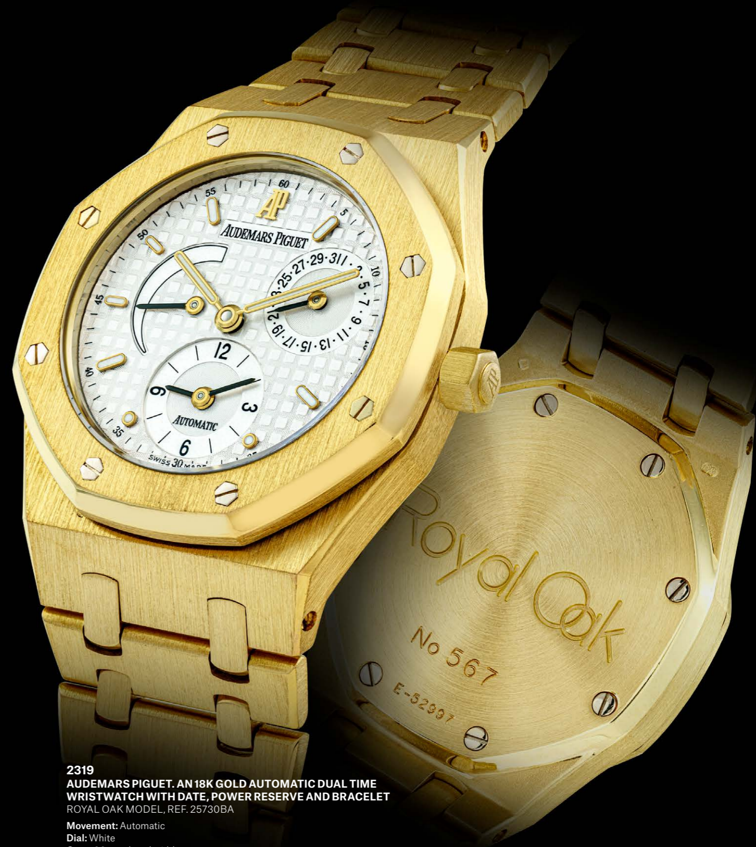
2319 AUDEMARS PIGUET. AN 18K GOLD AUTOMATIC DUAL TIME WRISTWATCH WITH DATE, POWER RESERVE AND BRACELET ROYAL OAK MODEL, REF. 25730BA

Movement: Automatic Dial: White Case: 36 mm. bezel width With: 18k gold Audemars Piguet bracelet, overall length approximately 200 mm., product literature, presentation box and outer packaging Remark: No. 567