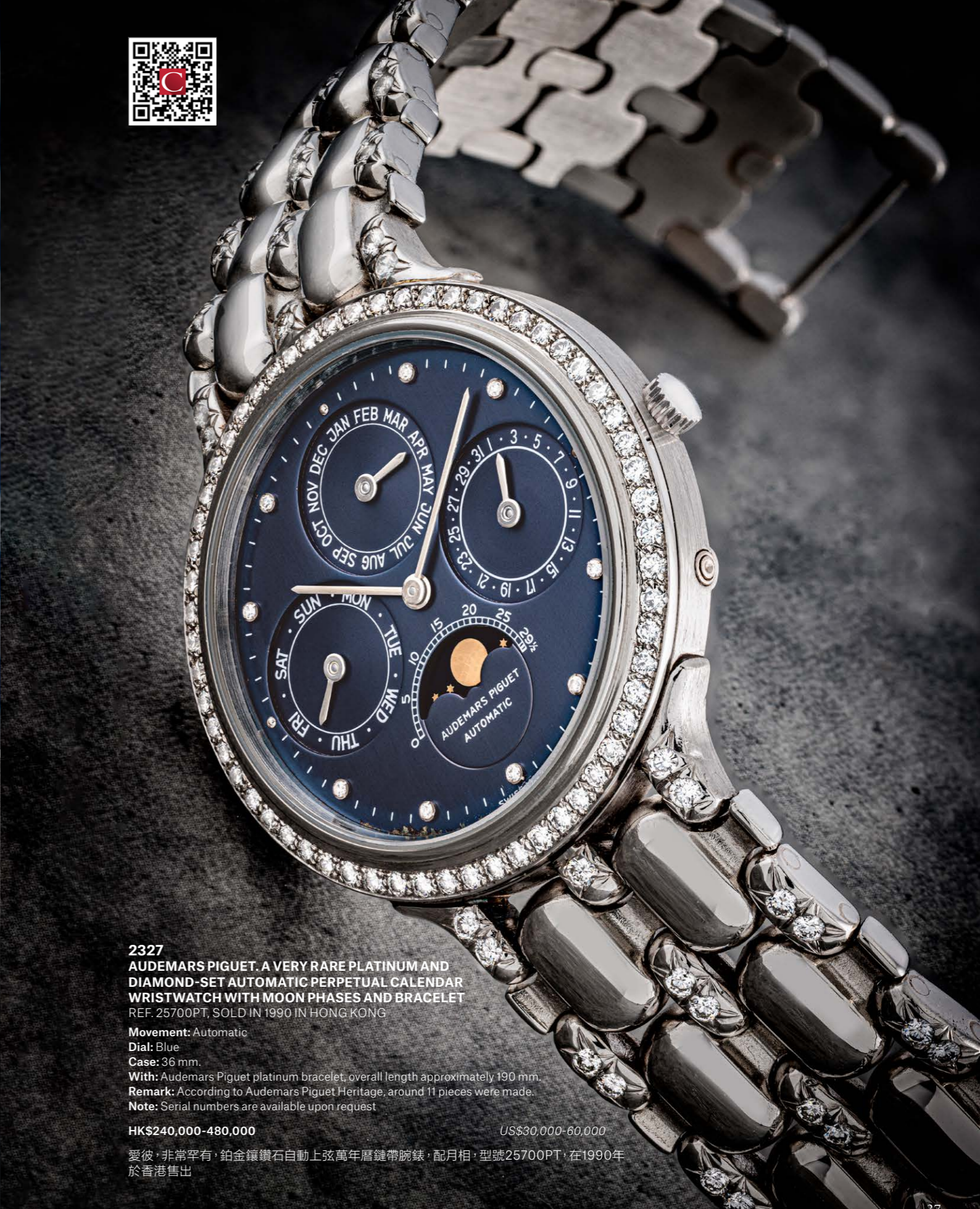
2327 AUDEMARS PIGUET. A VERY RARE PLATINUM AND DIAMOND-SET AUTOMATIC PERPETUAL CALENDAR WRISTWATCH WITH MOON PHASES AND BRACELET REF. 25700PT, SOLD IN 1990 IN HONG KONG

Movement: Automatic Dial: Blue Case: 36 mm. With: Audemars Piguet platinum bracelet, overall length approximately 190 mm. Remark: According to Audemars Piguet Heritage, around 11 pieces were made. Note: Serial numbers are available upon request