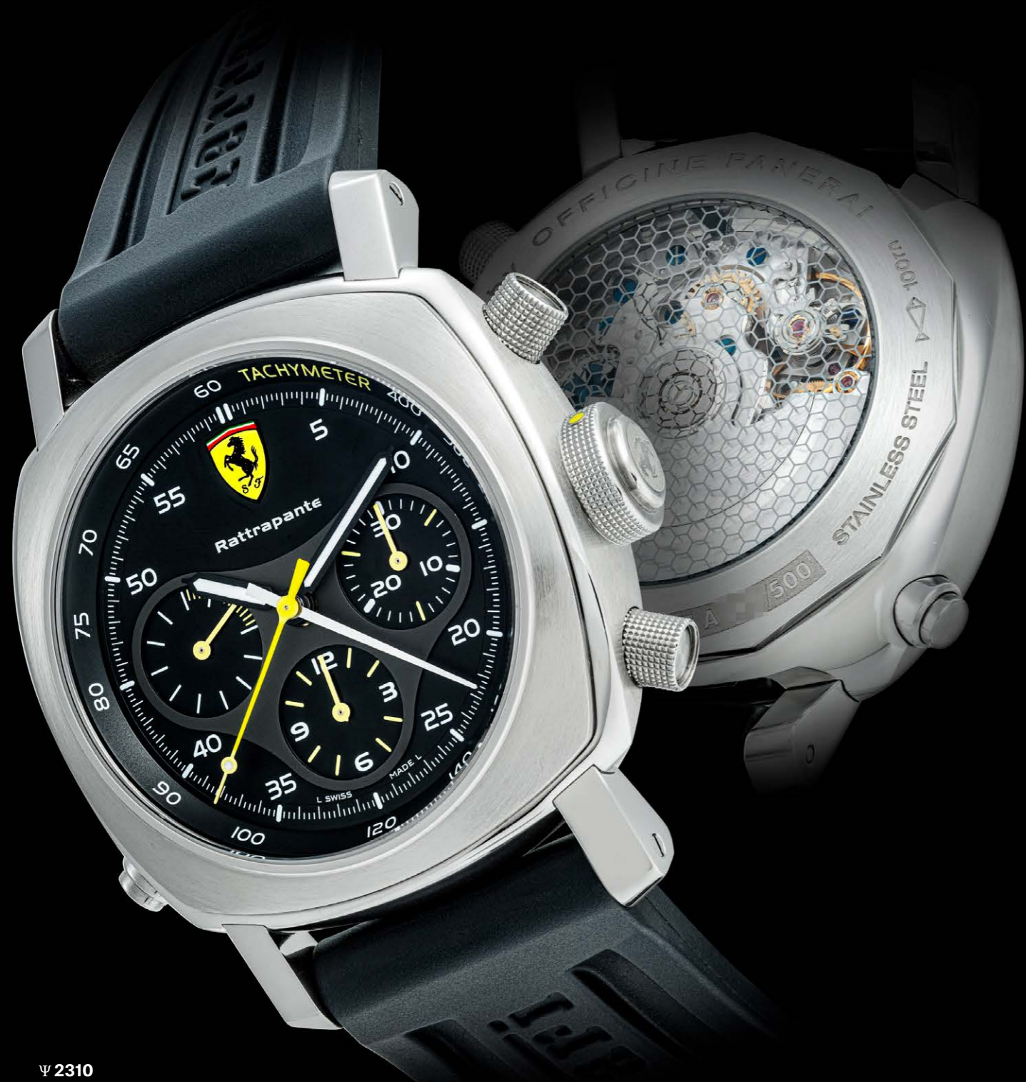
Ψ 2310 PANERAI. A STAINLESS STEEL AUTOMATIC SPLIT SECONDS CHRONOGRAPH WRISTWATCH REF. FER00010

Movement: Automatic Dial: Black Case: 44 mm. With: Stainless steel Panerai deployant clasp, COSC certificate, additional black Panerai CROCODILE strap, screw driver, presentation box and outer packaging Note: Serial numbers are available upon request