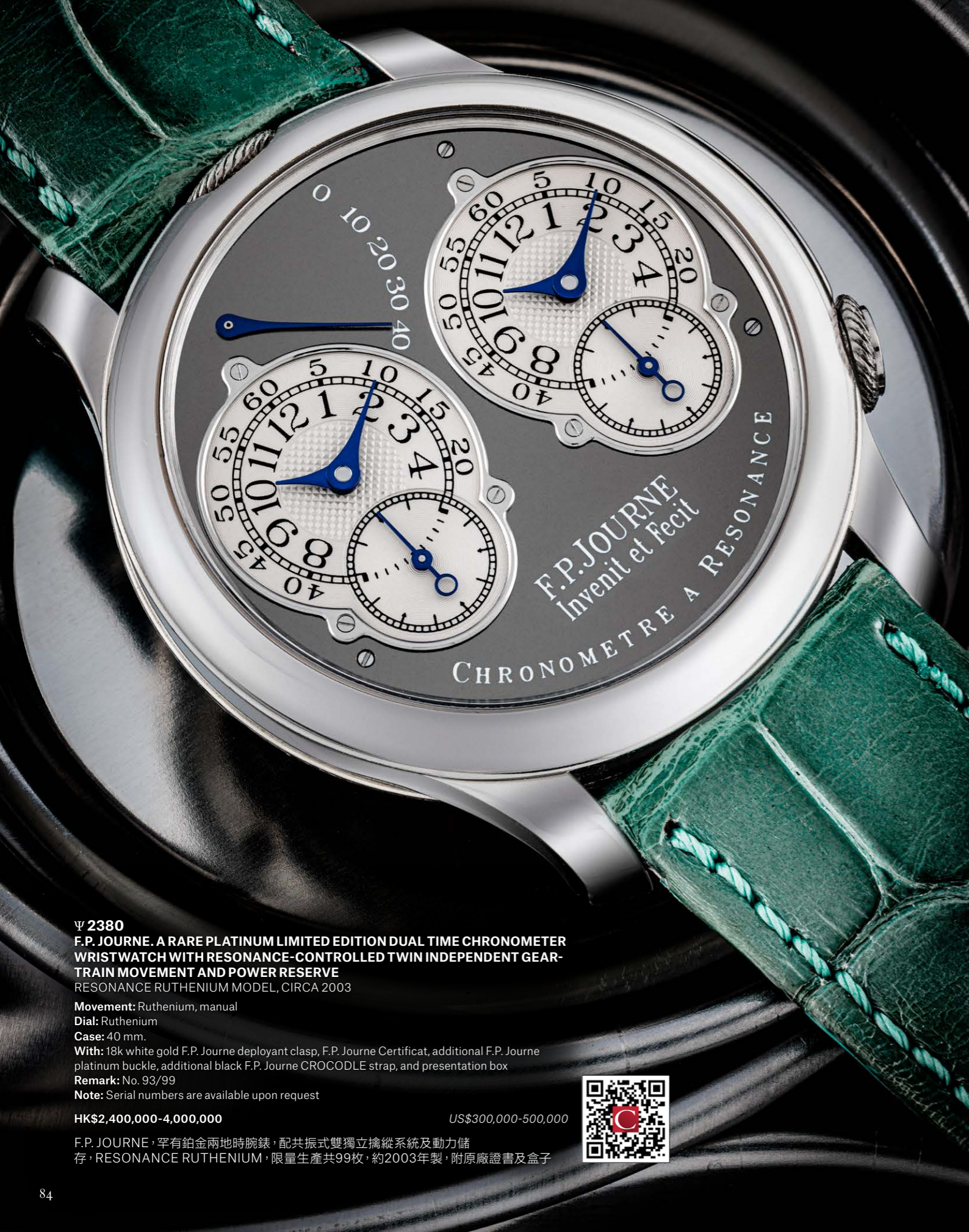
Ψ 2380 F.P. JOURNE. A RARE PLATINUM LIMITED EDITION DUAL TIME CHRONOMETER WRISTWATCH WITH RESONANCE-CONTROLLED TWIN INDEPENDENT GEAR-TRAIN MOVEMENT AND POWER RESERVE RESONANCE RUTHENIUM MODEL, CIRCA 2003

Movement: Ruthenium, manual Dial: Ruthenium Case: 40 mm. With: 18k white gold F.P. Journe deployant clasp, F.P. Journe Certificat, additional F.P. Journe platinum buckle, additional black F.P. Journe CROCODLE strap, and presentation box Remark: No. 93/99 Note: Serial numbers are available upon request